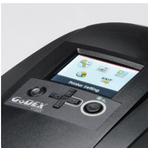
Color TFT LCD and operation panel for easy and intuitive operation

The RT200i barcode printer is packed with performance enhancing features that makes it the most powerful 2" thermal transfer printer