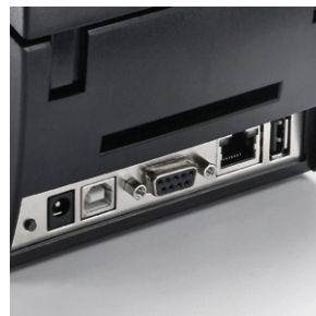
Ethernet, USB 2.0, Serial and USB host are standard features adding flexibility and power