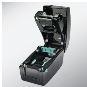
Modern clam-shell design makes it simple to load labels