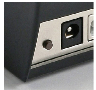
Innovative "C" button makes label Calibration simple and fast